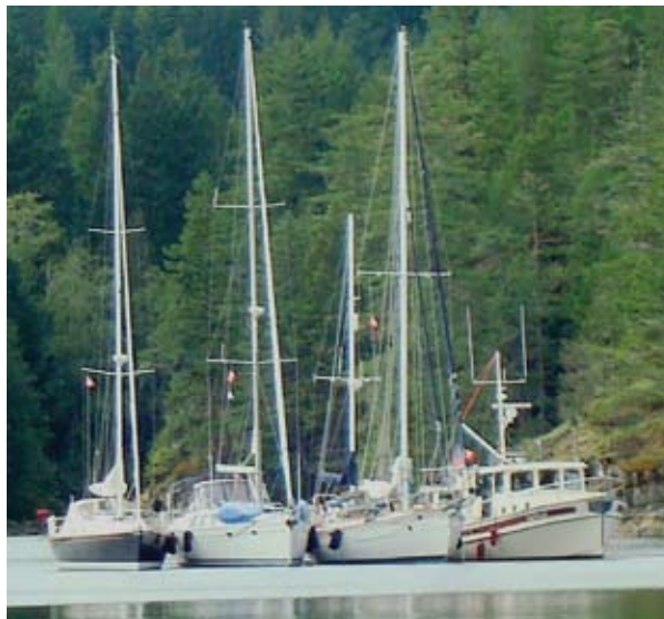
Two boats rafted with bow anchor and stern tie in Desolation Sound.

Setting up a boat to raft is very similar to the setup for a docking.